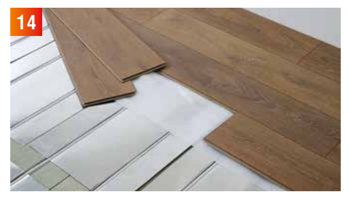
Both engineered and laminate can be installed directly on the heat transfer plates using a low TOG underlay. A minimum of 8mm engineered or laminate must be used.