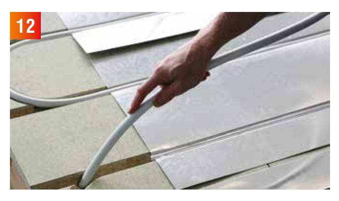
The installation of the heating pipe is begun by passing it through the floor to the manifold