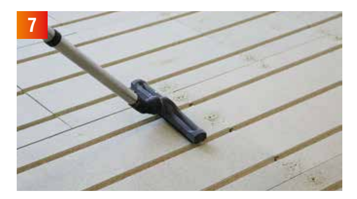
Before installing the heat transfer plates, the floor and the piping grooves should be cleaned of sawdust and other dirt.

There may be a need to cut the end returns, these cuts should rest on a joist or be supported by cross beams underneath.