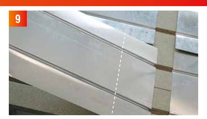
Cut the plates to the correct size. Straighten any bent corners of the plates before installation.