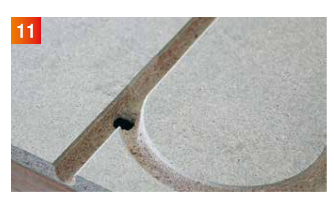
The inlets are milled before installation of the boards or directly to the floor surface.