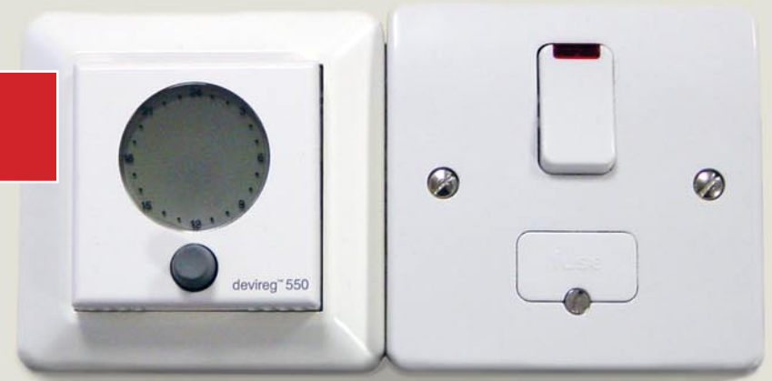
A closer look at a finished Devireg and Fused Spur.